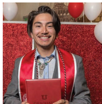
By Joaquin Galvan

Realistic goals are important when it comes to money. The average person's short-term financial goals should be simple: Try not to rack up too much debt, and find a steady job. When making financial goals, you should consider these three values: independence, stability, and security.